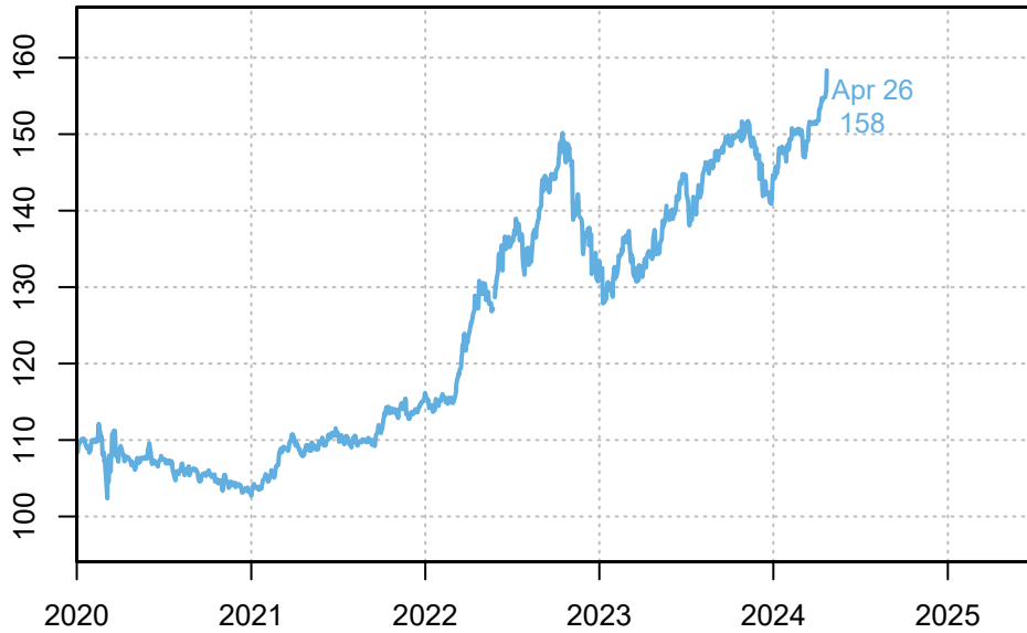
Yen per Dollar